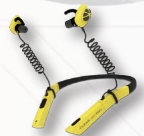
Hearing protection and industrial headsets CLEAR 360 PRO

The sound quality is improved by proprietary acoustic processing technology owned by Bongiovi Acoustics, USA. Many applications are available for different purposes, including the development of solutions for the hearing impaired, disaster prevention, medical care, home appliances, cars, aviation and entertainment. First of all, please experience the greatness of the system with a demonstration.